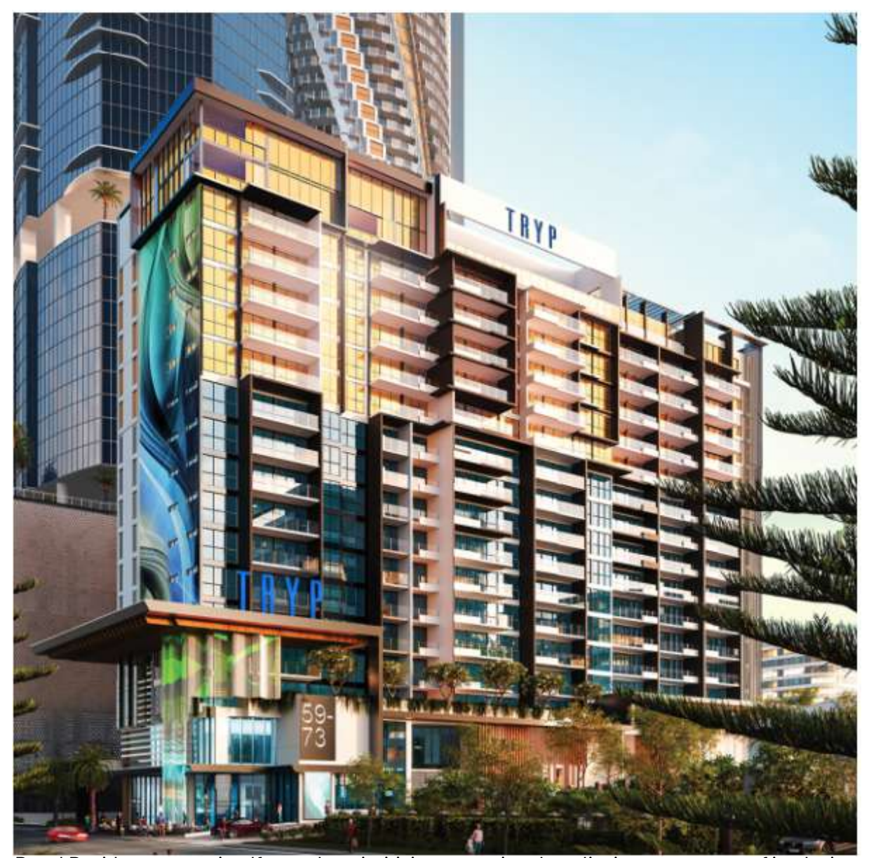
Regal Residences sets itself apart by prioritising exceptional quality in every aspect of its design and construction.

"We are one of the only developers in the region to include double-glazed windows as standard, ensuring superior insulation and noise reduction for residents.